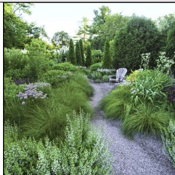
Prairie dropseed (sporobolus heterolepis) used to stunning effect at Olbrich Gardens.

I'm a big fan of switchgrass ( panicum virgatum ), a stalwart of the native tallgrass prairie. It's excellent